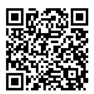
SCAN FOR MORE

IN THE NOSE, IT SHOWS BRAMBLY RED FRUITS, WITH NUANCES OF NO. 2 PENCIL SHAVINGS, RED AND WHITE GROUND PEPPER, AND A KISS OF OAK THAT SUPPORT THE FRUIT. JUICY IN THE MOUTH WITH A TOUCH OF SPICE.